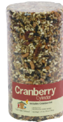
Tidy Cylinder Feeder

Non-Profit Org. U.S. Postage PAID Permit No. 118 Athens, GA 30601