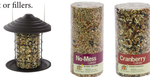
Tidy Cylinder Feeder

This great mix of sunflower chips and diced peanuts appeals to a wide variety of birds. (5 & 20 lb. bags). A no-mess option, this seed contains no millet or fillers.